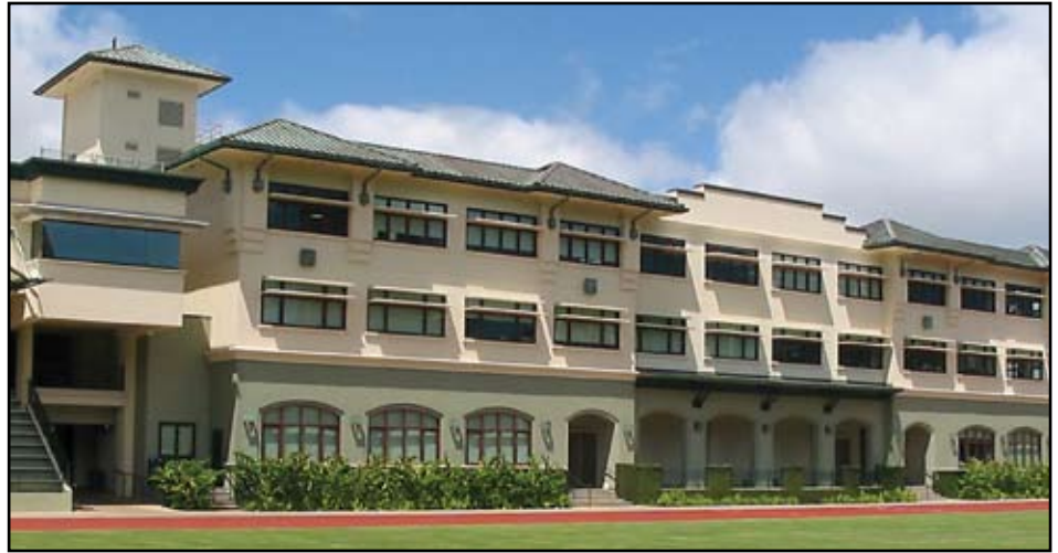
The Iolani School is one of the oldest schools in Hawaii, having been founded in 1863. The design reflects its roots as an Anglican school founded by English clergy, during Hawaii's monarchy period.

Ultraviolet-C (UVC) lights were first researched by the school in 1996, when they were installed on a trial basis in an air-handling system for enhanced IAQ and mold control — no small order in Hawaii, where mold will grow on almost anything. Initial before-and-after testing, performed in conjunction with HECO, showed that the test unit achieved a 99.8 percent reduction in mold levels after being treated with UVC light.