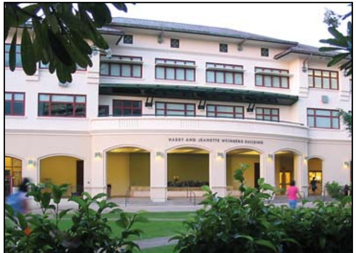
The school's Weinberg Classroom/Kozuki Stadium/Multipurpose Complex project was completed in 2003, finishing the first phase in a 20-year master plan to enhance facilities on this 20-acre campus.

chy period. The project's goal was to implement sustainable design strategies and technology without changing the look of the school.